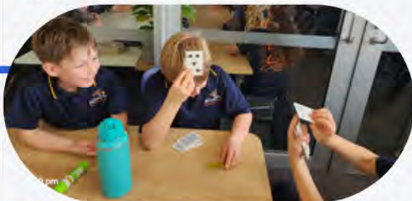
Using cards to play 'salute' is a fun, engaging way to consolidate number fact knowledge.

Throughout this year at Alberton, we have continued to 'shine a light' on Mathematics, and how we teach it. We have partnered up with North Haven Primary School and have had several joint training days focussing on maths, and how we can improve our teaching of maths. This has resulted in the development of a 'Maths Instructional Model' ( a structural model for our maths lessons here at Alberton).